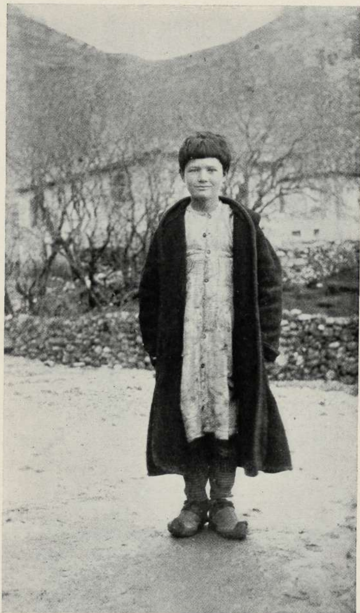
A FUTURE AMERICAN